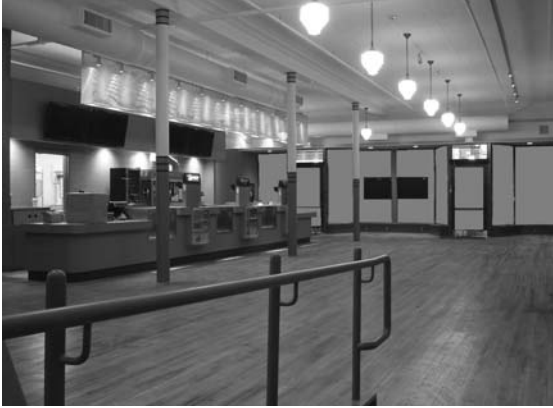
Lobby of Cinema

Without government assistance and the historic preservation tax credits, the project would never have reached fruition. Historic preservation tax credits were an invaluable component of financing for the project, providing a necessary infusion of capital toward the cost of construction. In addition to these credits, the city's easement of the building façade allowed for the exterior restoration to be completed as a separate municipal project.