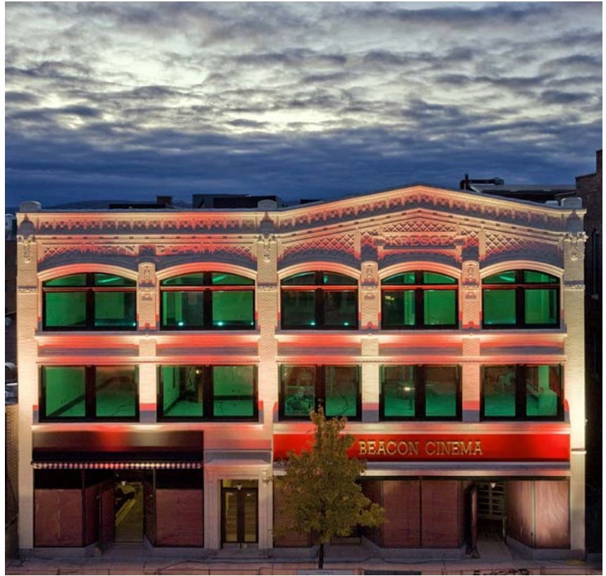
Beacon Cinema (Located in Pittsfield, MA)